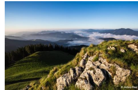
Best Parks in Suceava, Komarno and Pisa